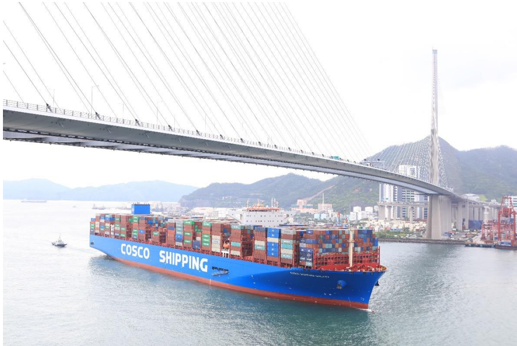
COSCO SHIPPING GALAXY passing through the Stonecutters Bridge and entering into Hong Kong Kwai Tsing Container Port