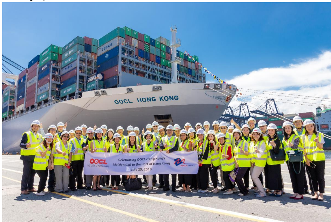
Guests welcome the arrival of OOCL HONG KONG on her maiden call to Hong Kong