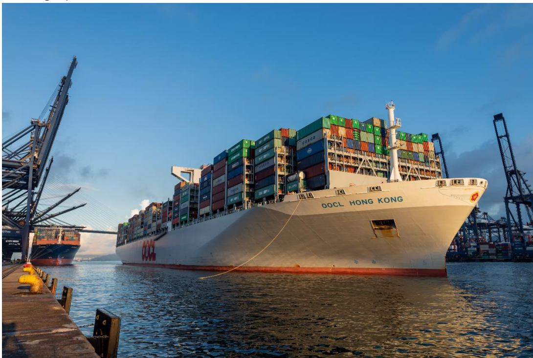
OOCL HONG KONG berths at HKSPA's facilities at Terminal 8