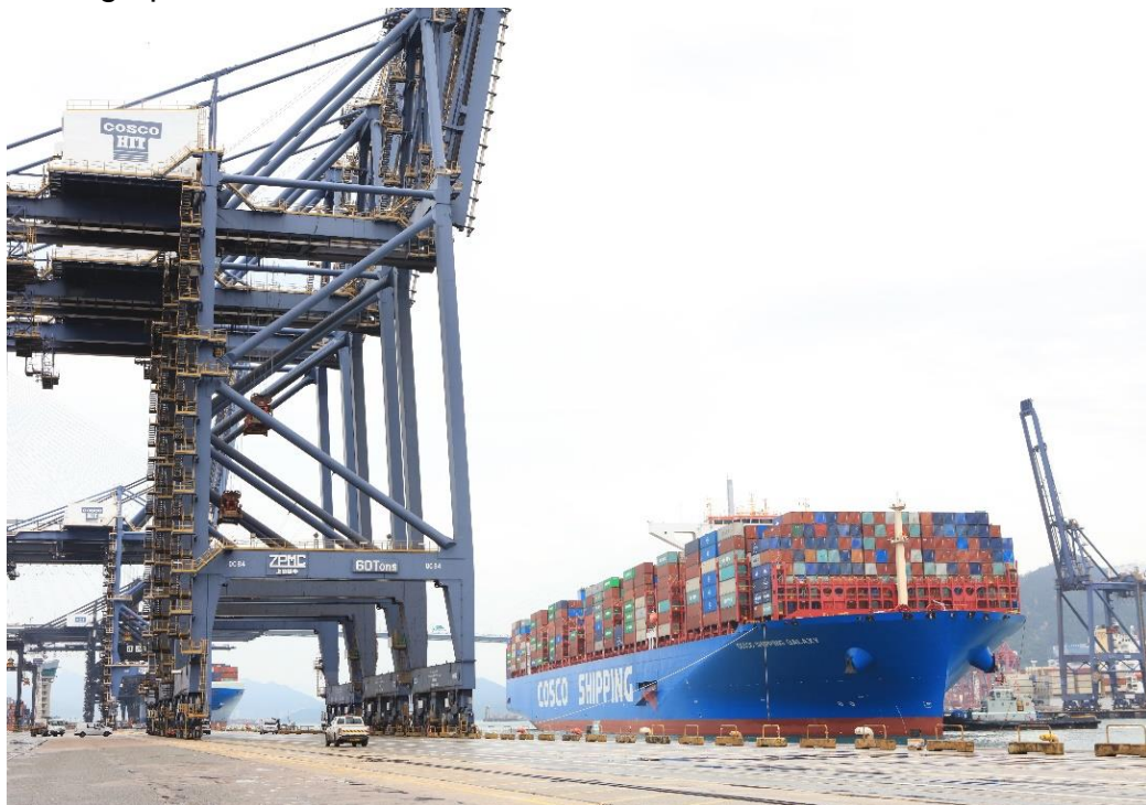
COSCO SHIPPING GALAXY berthing at Hong Kong's Terminal 8